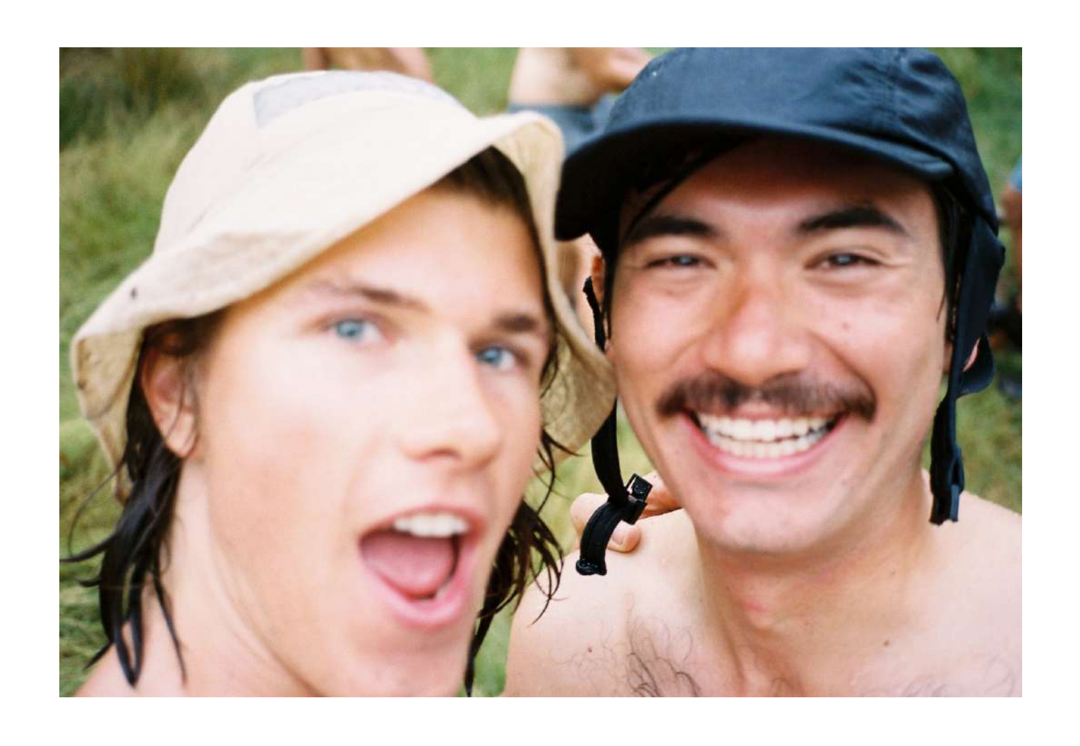
Authors Note: Quick Big Stick is a game of agility and cunning; two things that Luke had in short supply.